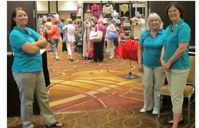
The Show staff welcomes attendees to the Expo.

Photos from the Indianapolis Summer Show are now available to view at TKGA.com/?page=ConferenceHistory . Here's a sneak peek!