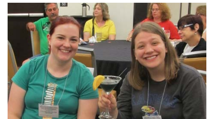
Come for the knitting, stay for the fun!